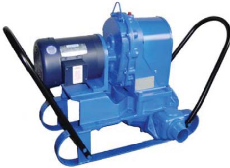
Available on Wheels or Skid MCP5411-1ST (Shown), MCP5411-3 MCP6411-1, MCP6411-3