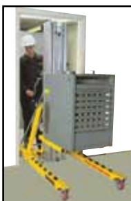
Fits through doorways!

Reversible Forks Using plunger pins, forks remove and reverse easily for added height or to get flush with a ceiling. No loose pieces!